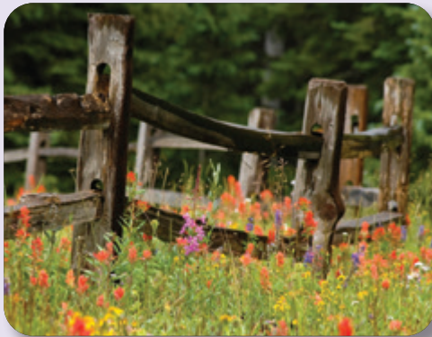
The first bloom of wildflowers signals spring has truly arrived.

In Texas, vast grassy areas make for a unique display of Bluebonnets and so many more varieties to enjoy. ■