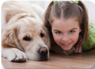
Pet dander is one of the most common indoor air allergens.

Your HVAC system's filter trap dust and other airborne pollutants as it's running. Make sure you use the highest-quality air filters that are compatible with your cooling system, and change them on a regular basis. When you're purchasing an air filter, consider the MERV rating (Minimum Efficiency Reporting Value). Higher-efficiency filters capture more airborne particulates — a great option for allergy sufferers. ■