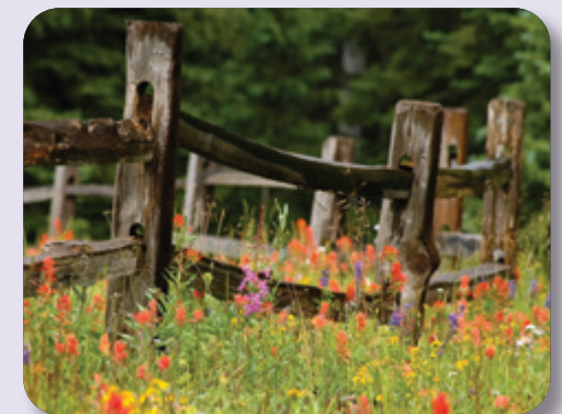
The first bloom of wildflowers signals spring has truly arrived.

In Texas, vast grassy areas make for a unique display of Bluebonnets and so many more varieties to enjoy. ■