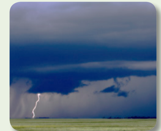
Derechos are clusters of thunderstorms with wind gusts in excess of 60 mph.

Spring conditions are ripe for the formation of thunderstorms that, in addition to lightning, can be accompanied by dangerous hail. The best way to stay safe during a thunderstorm is to stay indoors. If you're caught outside, stay away from trees, poles and metal objects. Remember, never underestimate this unpredictable force of nature. ■