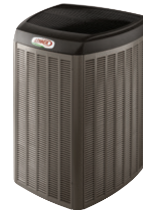
The XC25's cooling output is adjusted in increments as small as 1%, so your energy use and comfort are precise.

Sometimes even small changes yield big results — that's the philosophy behind the Lennox XC25 air conditioner. Utilizing revolutionary Precise Comfort® technology, the XC25 makes tiny, ongoing adjustments in output to keep your air temperature consistent within 0.5 degrees of your thermostat setting.