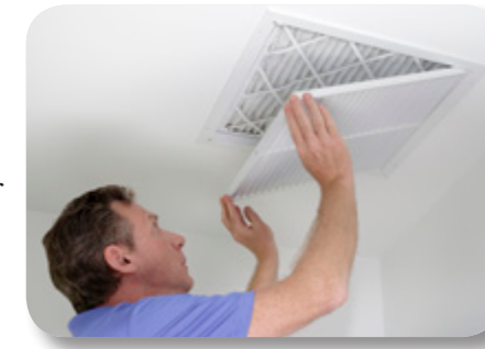
A clean air filter prevents dust and dirt buildup, which could lead to early HVAC system failure.

Changing your air filter may not sound like that big a deal, but we can assure you that failure to do so will negatively impact your home cooling experience, utility bill and health of your A/C system. Check your filter(s) every month so that during heavy-use months, and at a minimum, change every 2–3 months.