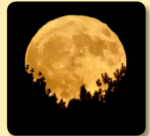
The Full Moon that occurs closest to the date of the Autumnal equinox is known as the Harvest Moon. For 2018, the Harvest Moon will occur on Sept. 24.

While the moon may have no direct effect on the weather, it does have a great deal to do with governing moisture. Not only does it control ocean tides, but it also influences groundwater tables. This gravitational effect on the flow of moisture in the soil and vegetation has long fed the belief that gardening and planting crops according to the phases of the moon is a natural and beneficial approach. Farmers and gardeners who embrace this practice follow a strict lunar cycle that guides them as to when to plant, when to prune and even when to weed. ■