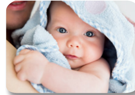
Set your water heater temperature at 120°F to protect loved ones from severe burning and scalding.

As with all major appliances, regular water heater maintenance will provide years of service and peace of mind. ■