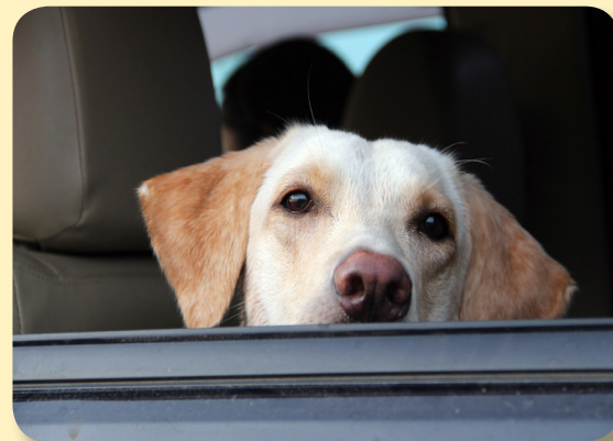
Never leave your pet alone in a parked vehicle. Not only can it lead to fatal heat stroke, it's illegal in several states.