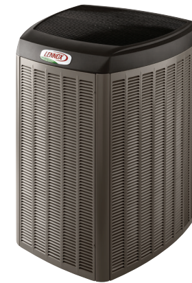
The XC25's cooling output is adjusted in increments as small as 1%, so your energy use and comfort are precise.

With efficiencies of up to 26 SEER, the XC25 can help you save hundreds in utility costs every year. Call us today to learn more. ■