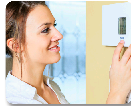
If you're installing a new central cooling system, now is the time to upgrade your thermostat.

Some thermostats offer smart features, such as reminders when it's time to change the air filters or alerts when there is some kind of malfunction in other parts of the system. You can use these smart features to maintain a comfortable and constant home environment for you and your family. ■