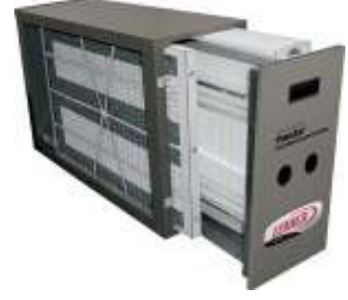
PURIFIER – MERV 16 w/ Carbon Clean & UV Protection – Lasts 1 Year