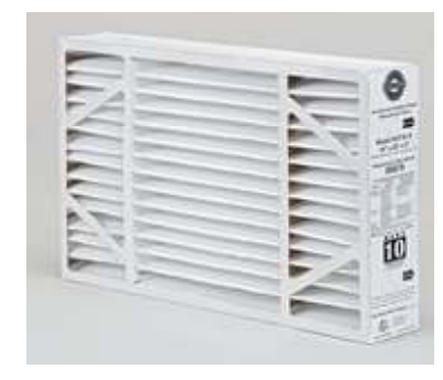
MERV 10 Filter – Lasts 3-6 Months