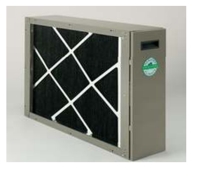
MERV 16 Filter w/ Carbon Clean to reduce low-level ozone – Lasts 1 Year